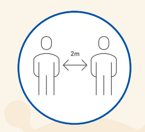
SOCIAL DISTANCING 2M / 6FT